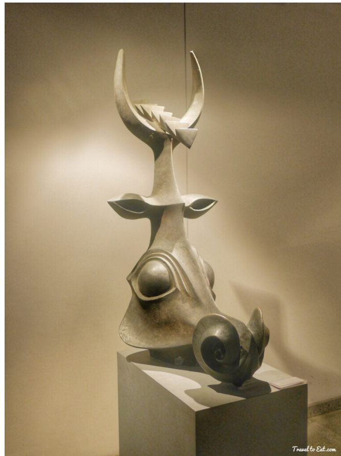
Bull's Face by Ahmed Abdel-Wahab 1972. Bibliotheca Alexandrina

At the Bibliotheca Alexandrina, they had a retrospective exhibition of the prominent Egyptian sculptor Ahmed Abdel-Wahab (born in 1932) and I thought I would share. Abdel-Wahab is an eminent figure among contemporary Egyptian sculptors. He devoted his artistic experience in pursuit of a contemporary character to be the model of a pure Egyptian sculpture. The character of Akhenaton attracted his attention with its contemplative noble features and firm piety. Abdel-Wahab epitomized Akhenaton in different forms, in which he maintained the essence of contemplation and human piety. He created large and small-scale sculptures, as well as a relief sculpture with extensive attention to ornamentation. He also created rhythmical sculpture compounds in which he linked the triangular and rhombus-shaped masses together by colorful lines. The artist also resorted to abbreviating the details to emphasize the mass and achieve dramatic shadowy projections, which emphasize the idea of holiness and mysticism. In creating these pieces of art, the artist used many materials, like pottery, stone, and polyester with metal. He was awarded the State Merit Award for art in 2002.